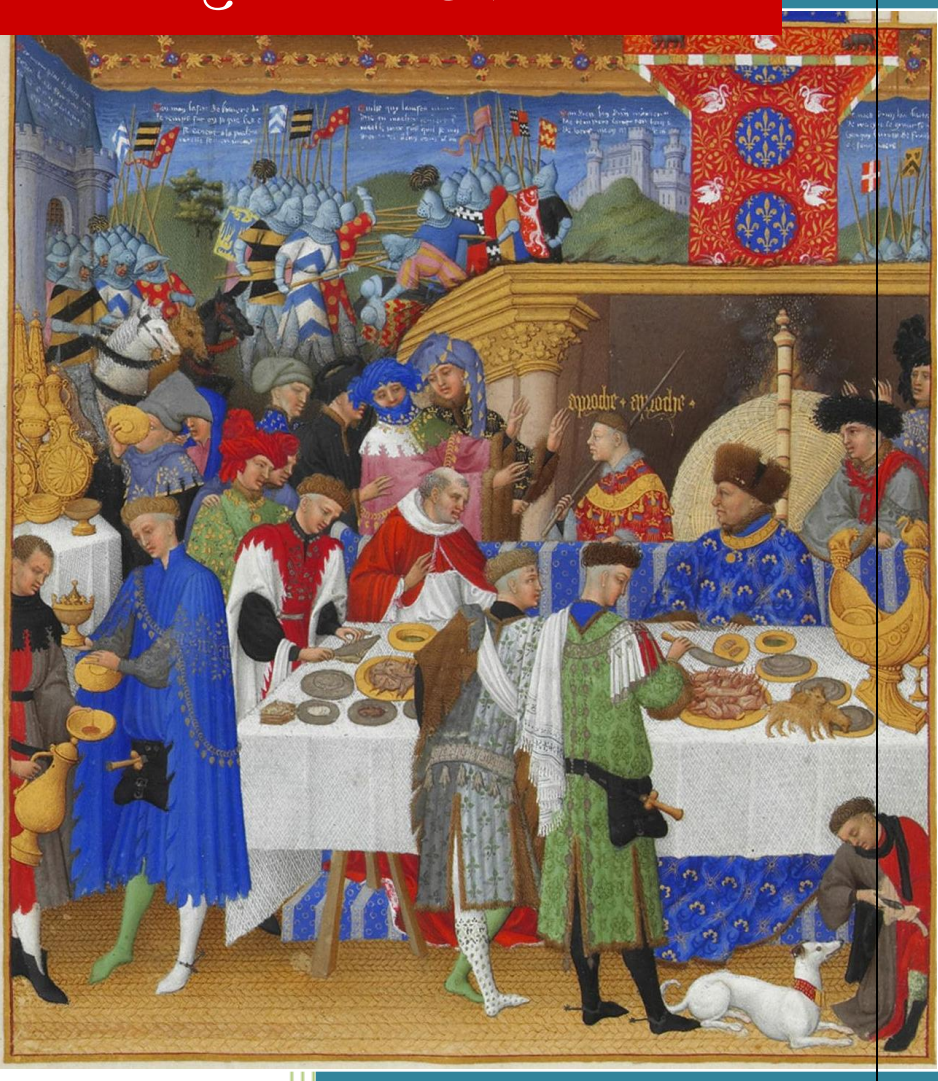
The Barony of Dun Carraig