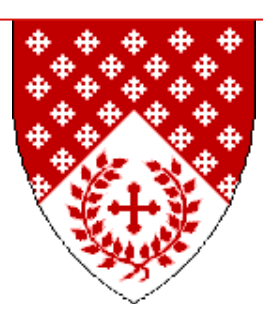
Dun Carraig's Arms

lating to hearts, as the virtues are the theme for the Challenge part of the event.) The A&S Champion for Dun Carrais will be chosen from this competition. The second competition involves the decoration of the helms before the Challenge. Entrants will be judged based on use of torse, mantling and/ or crests as well as documentation. It is requested that for this token point fighters produce some tupe of written research on their helm. Any research on the torse, mantling, cresting, etc. is acceptable and entrants may use both modern and historic references. On the Novice Tourney (Storvik's event) side of things, there will be no Un-belt tourney due to time constraints with the other tourneys happening. Any information about the