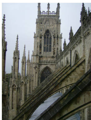
A view of the buttresses that adorn the York Minster