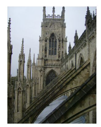
A view of the buttresses that adorn the York Minster