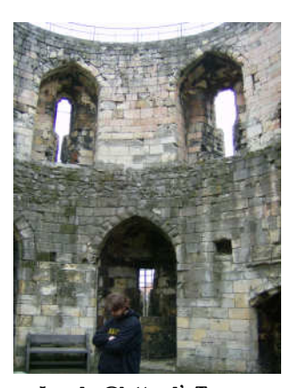
Inside Clifford's Tower

to hear from more people this month. *grin*