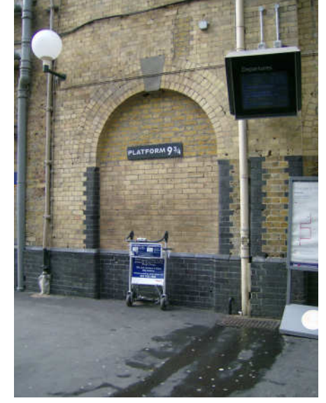
For all you Harry Potter fans out there...Platform 9 3/4 at King's Cross Station, London.

Heraldry Day was held on March 2nd. One person showed up.