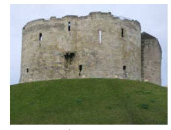
Clifford's Tower in York, England