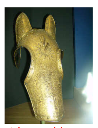
A champron with decorative rondel—Equine armor on display at the White Tower, Tower of London

Rules haven't changed, so make sure you're up to date. Thrusting force has been clarified: Helmet ruling is back to positive force. Logan's reign is ending: combat archers can now come back out. Sinclair does not have the same regulations.