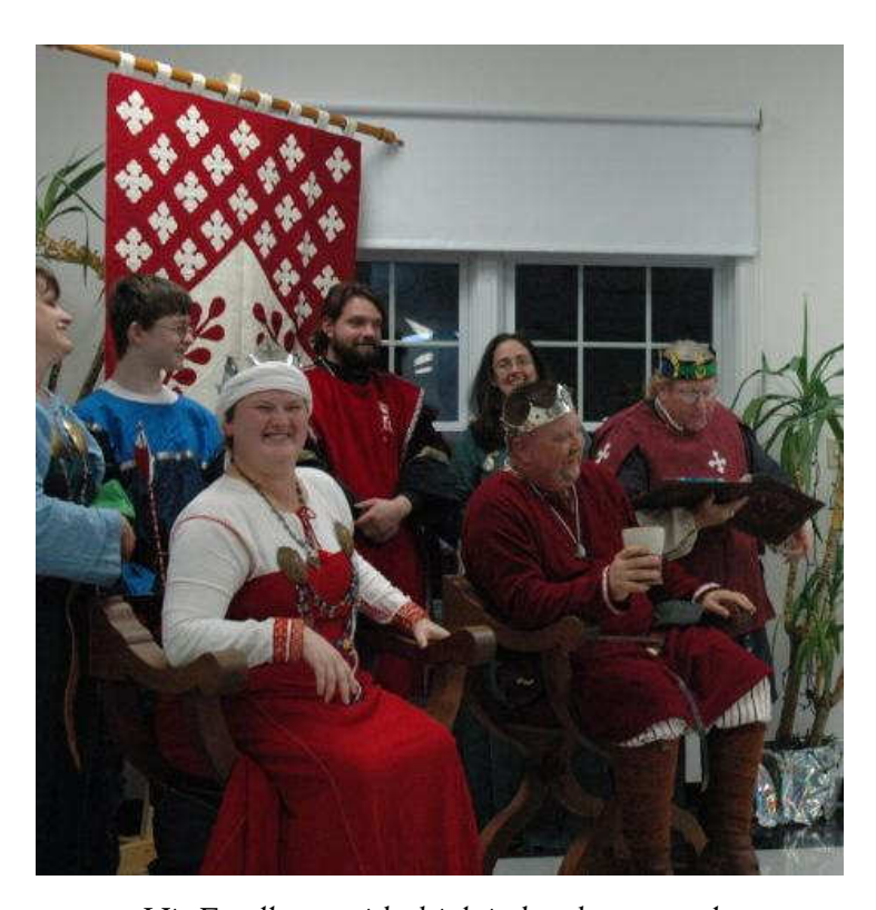
His Excellency with drink in hand—as usual.