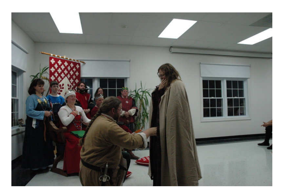
Lord Mathias proposes (again) to Lady Serena. Everybody say it with me. One...two....three... AAAAWWWW