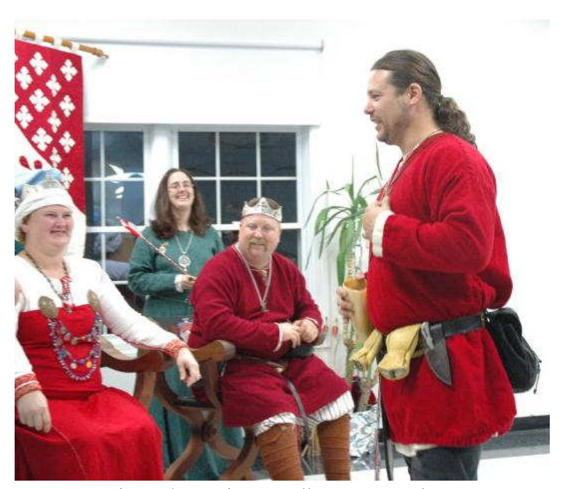
Theron keeps their Excellencies amused.