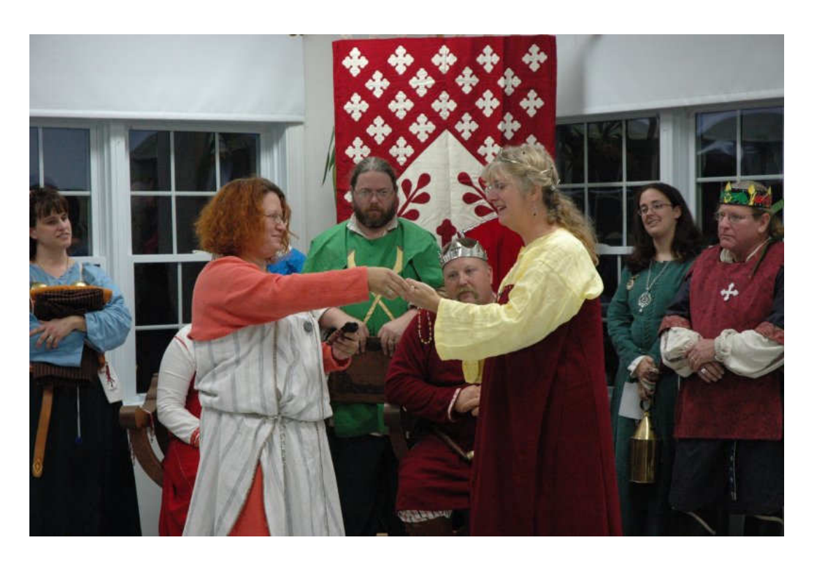
Mistress Rose takes Lady Minna as a protégé.