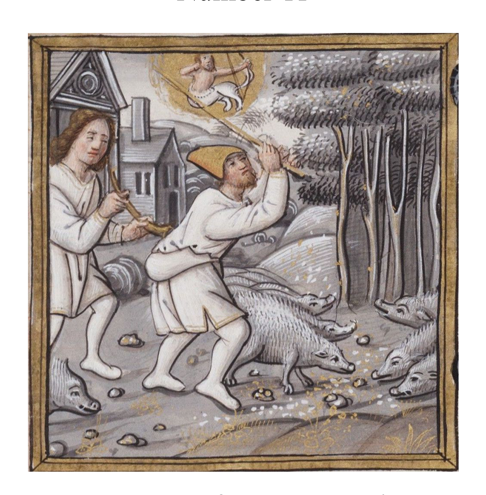
Barony of Dun Carraig Kingdom of Atlantia