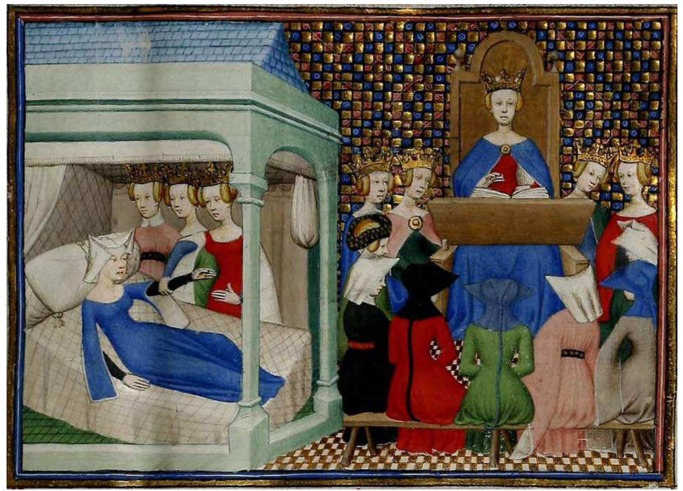
Illustration from Le Livre des Trois Vertus

https://archive.org/details/lelivredestroisv00chriT