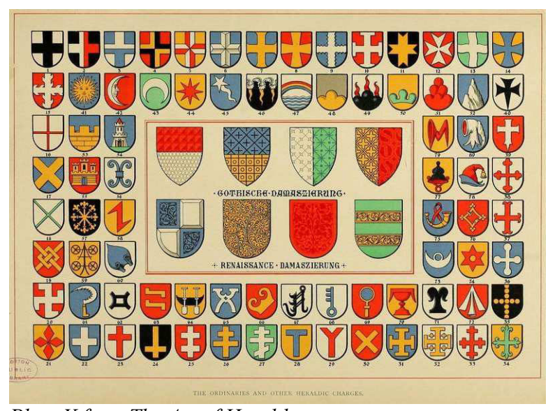
Plate X from The Art of Heraldry

The Art of Heraldry - An Encyclopaedia of Armory by A.C. FOX-DAVIES, TC and EC Jack, London 1904 https://archive.org/details/artofheraldryenc00foxd