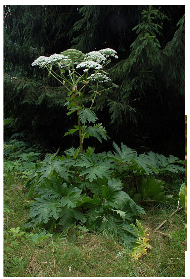
Giant Hogweed flower