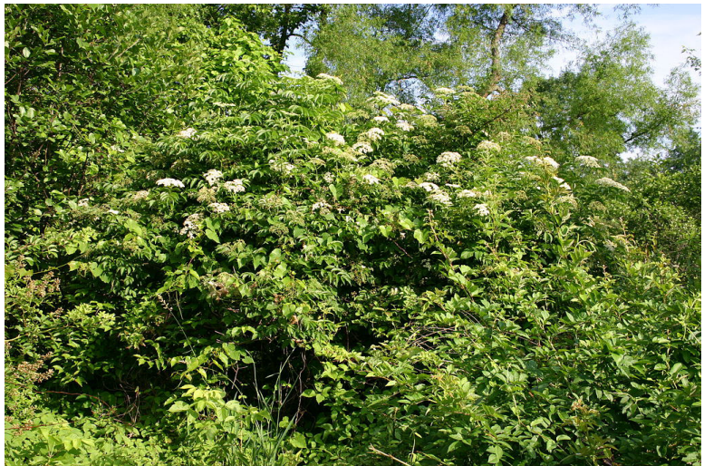
More elderberry bushes in flower