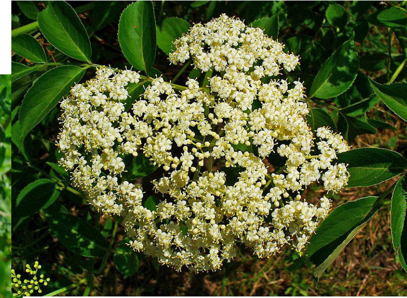
Closeup of elderberry flower