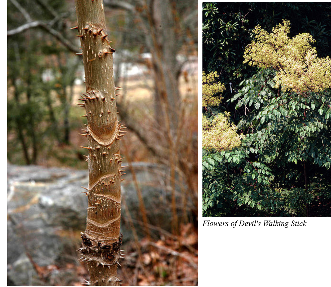
Stem of Devil's Walking Stick

These berries can be used for dye, but they are not edible.