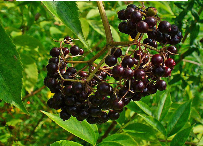
Ripe elderberry cluster