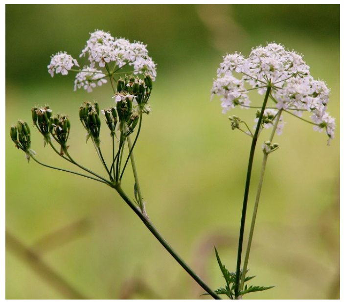
Cow Parsley flower and seeds

Wild Hemlock (Conium maculatum) (poisonous to eat) Giant Hogweed (Heracleum mantegazzianum) (poisonous to touch, raises blisters)